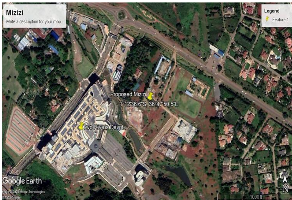
Figure 1: Proposed project site

The proposed development shall be connected into the existing Two Rivers infrastructural developments including treated water, Sewer treatment plant trunk-line and electricity among others. The proposed site for the earmarked development is on site coordinates; 1^{\circ}12'36.6''\text{S} , 36^{\circ}47'50.5''\text{E} (-1.210175, 36.797372) as presented in Figure 1 and Plate 1 below.