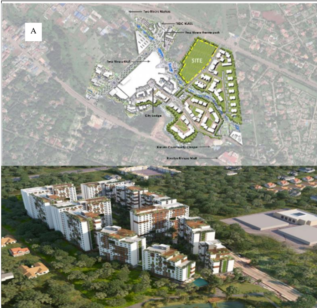
Plate 1: A- project area of influence; B- Artistic impression of proposed project

Construction power will be from the Kenya Power and Lighting Company (KPLC). The project will utilize permanent power from Two Rivers. The various components of the electrical system shall comprise single and twin socket outlet, lockable meter board with glass view panel, gate lights and security alarm panel outlet and CCTV connection system. The relevant guidelines and precautionary measures relating to the use of electricity shall be adhered to.