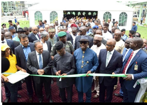
IMAGE OF ACTING PRESIDENT INAUGURATING THE FERTILIZER FACILITY

THE FINAL THUMBS UP TO OUR SITE FUNCTIONING WAS THE COMMISSIONING OF FERTILIZER PLANT BY THE THEN ACTING-PRESIDENT OF NIGERIA ON 29 TH JULY 2017.