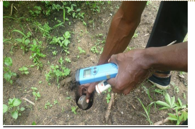
Soil Sampling and In-site measurement