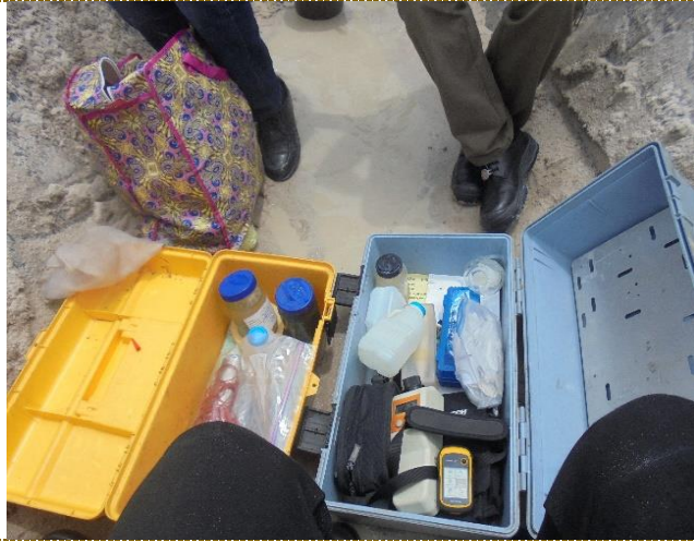
In-Site measurement Equipments