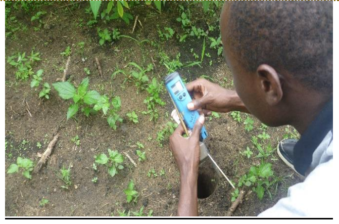
Soil Sampling and In-site measurement