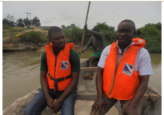
Moving to Up-stream – Okulu Stream