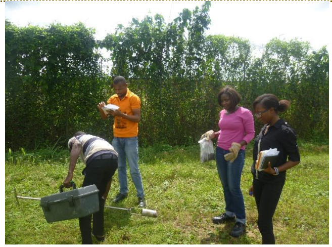
Field Data Recording