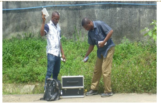
Ambient Air Quality Monitoring