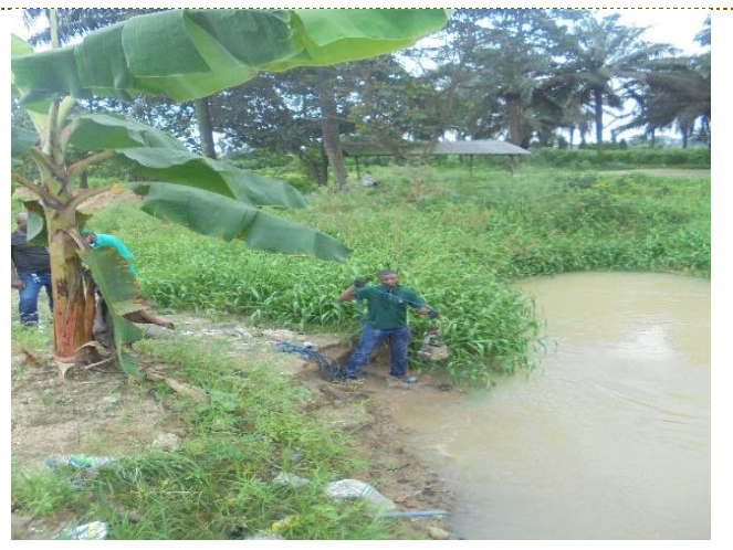
Surface water / Sediment / Hydrobiology Sampling