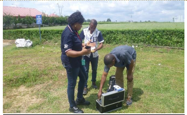
Ambient Air Quality Monitoring