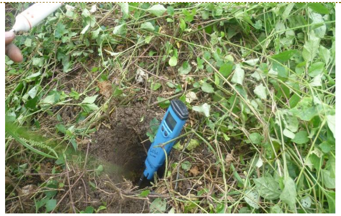
Soil Sampling and In-site measurement