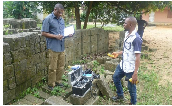
Ambient Air Quality and Noise Monitoring