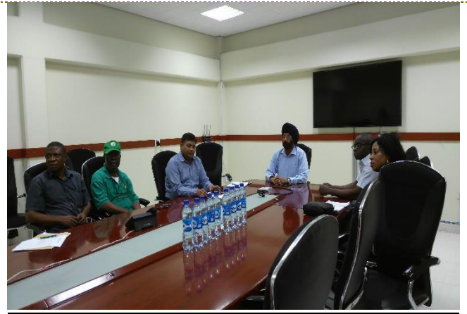
Kick-Off Meeting with Regulators