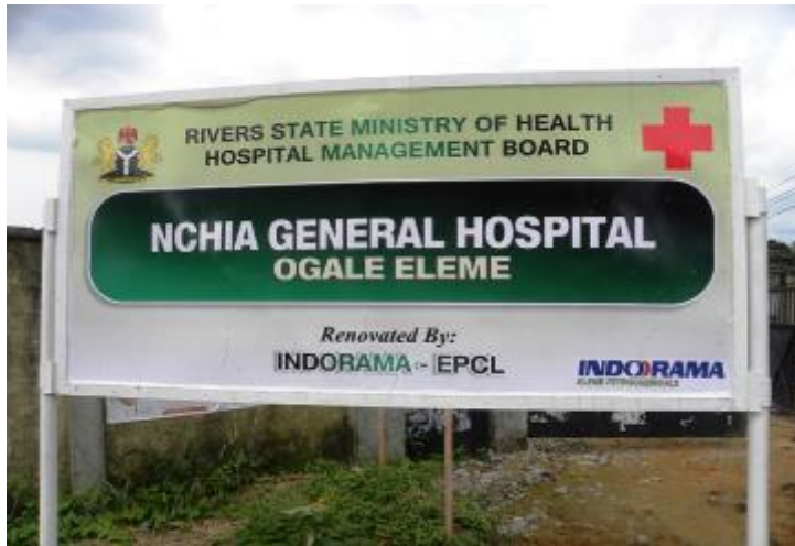
Renovation of Hospital