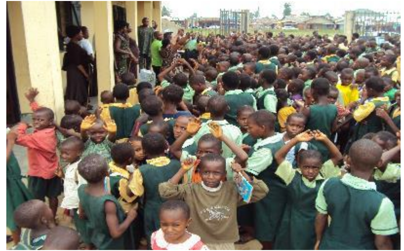
Donation of notebooks to schools in Eleme and Excited pupils