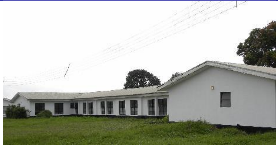
Renovated Nchia General Hospital Eleme