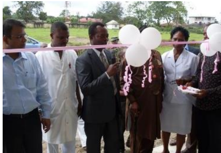
Commissioning of the New Roads at Nchia Hospital