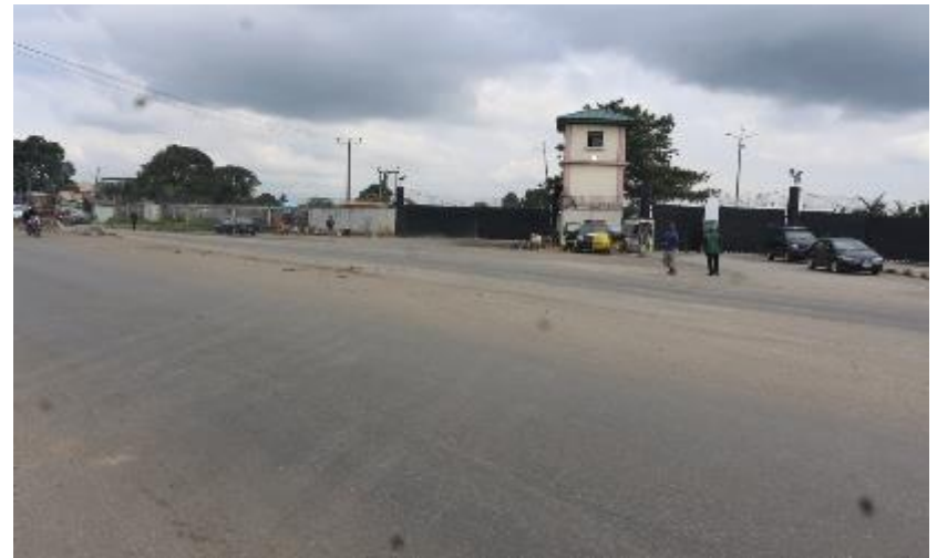
Federal Highway -- N530 million donated