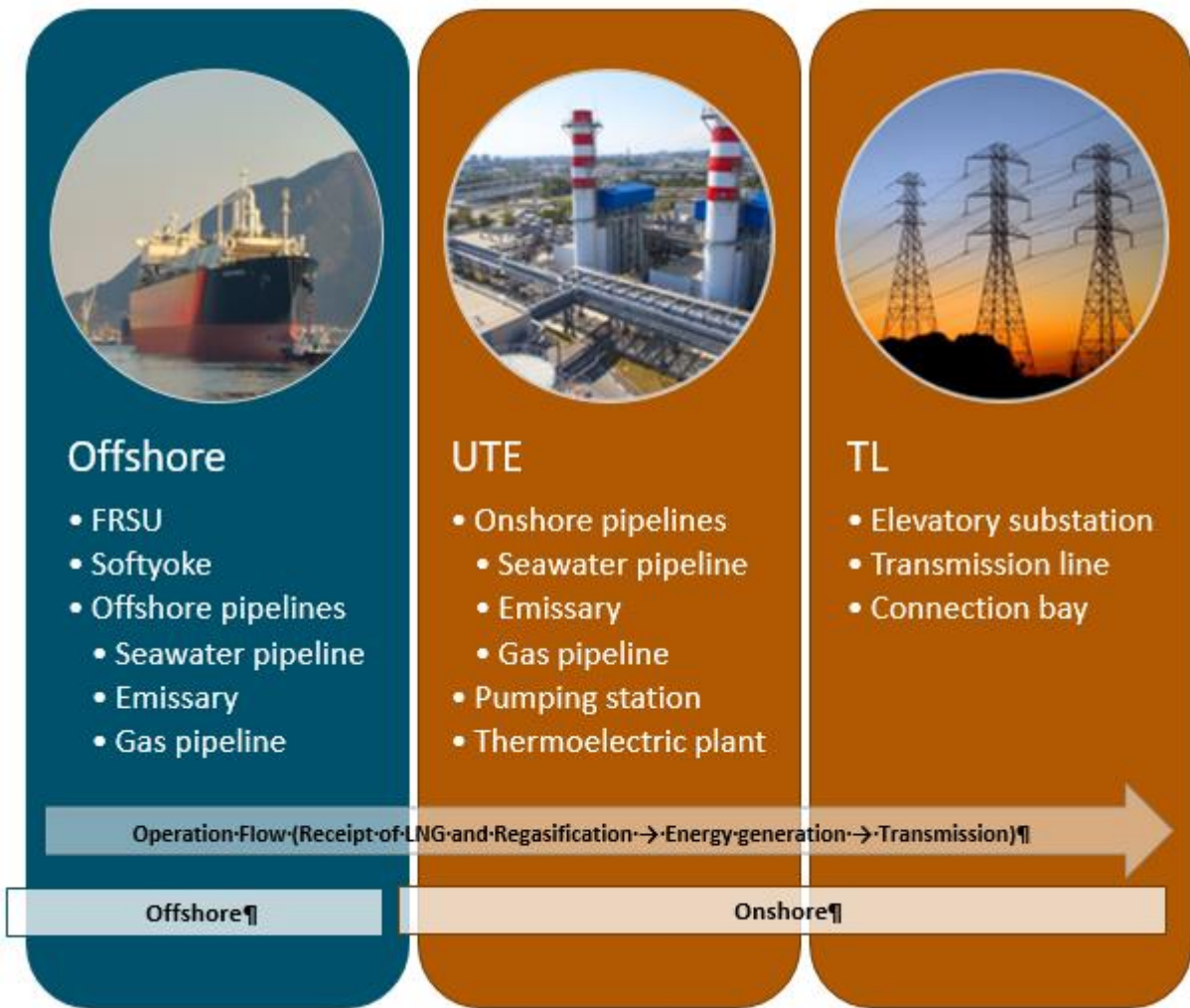
Figure 2: Porto de Sergipe | Thermoelectric Complex diagram