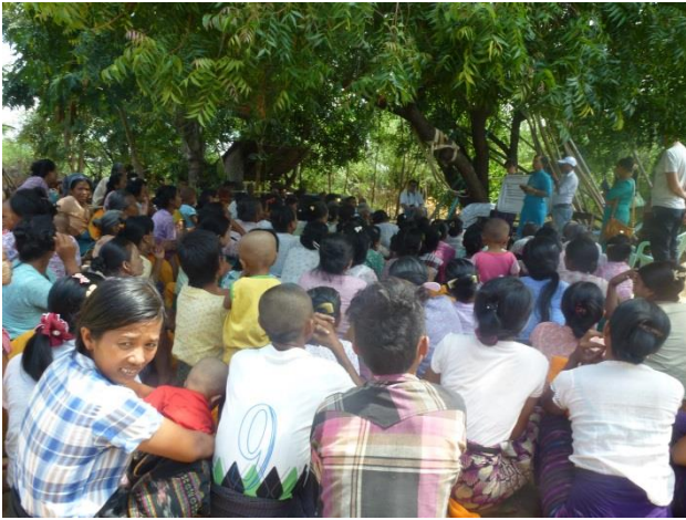
Photo 73: Public Meeting in Nyaung Kan (village)