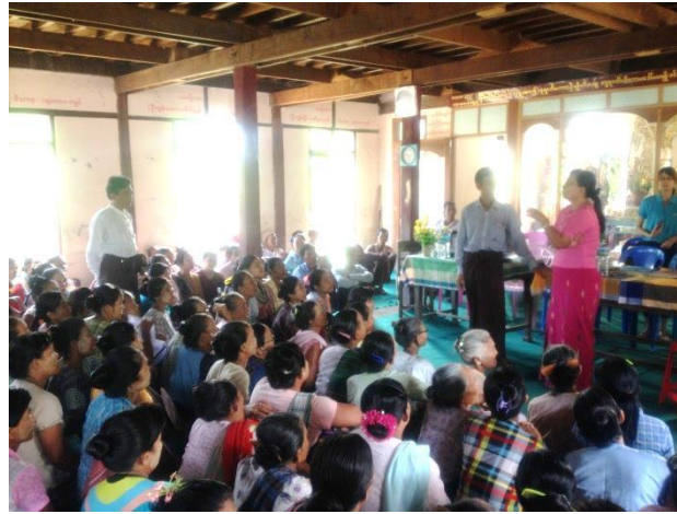
Photo 44: Public Meeting in Tha Pyay Thar (village)