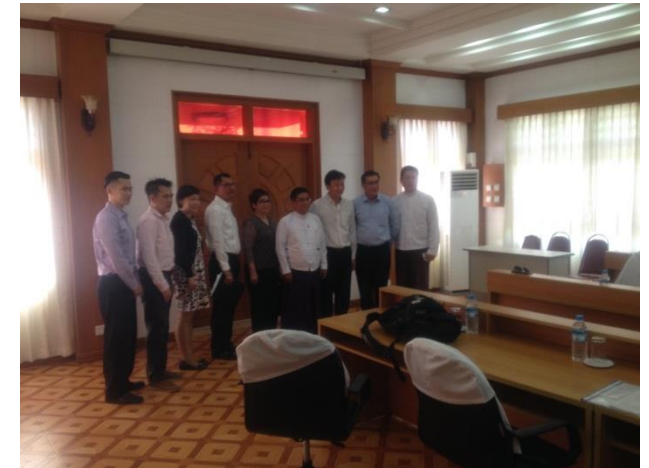
Photo 6: Face-to-face meeting with Ministry of Electricity and Industry, Mandalay Region