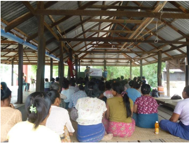
Photo 31: Public Meeting in Sa Khar (village)