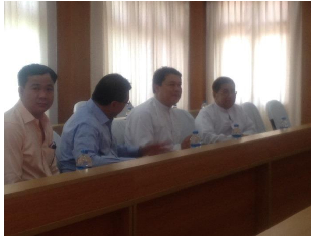
Photo 2: Face-to-face meeting with Ministry of Electricity and Industry, Mandalay Region