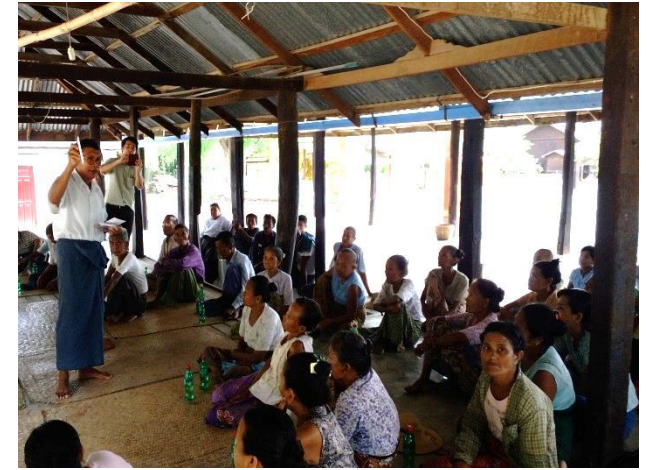
Photo 51: Public Meeting in Sa Khar (village)