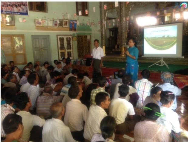
Photo 64: Public Meeting in Hpet Taw (village)