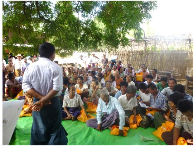
Photo 74: Public Meeting in Nyaung Kan (village)