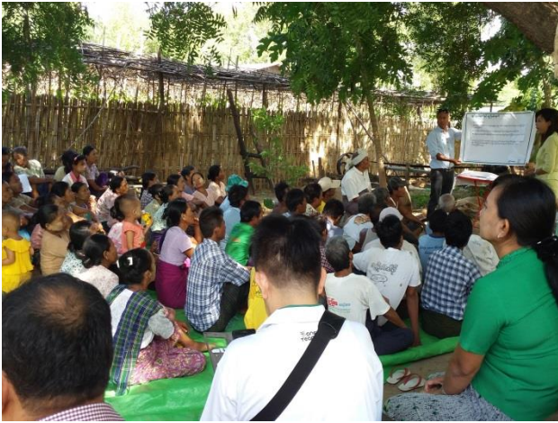
Photo 49: Public Meeting in Nyaung Kan (village)