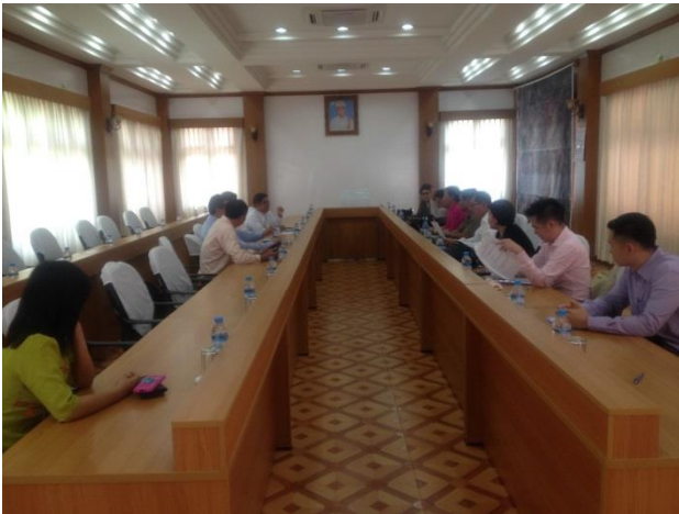
Photo 4: Face-to-face meeting with Ministry of Electricity and Industry, Mandalay Region