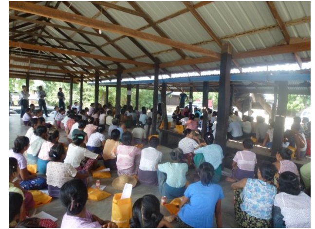
Photo 69: Public Meeting in Sa Khar (village)