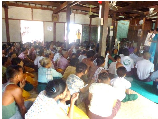
Photo 77: Public Meeting in Thien Ywa (village)