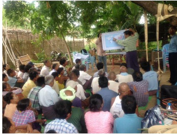
Photo 26: Public Meeting in Nyaung Kan (village)