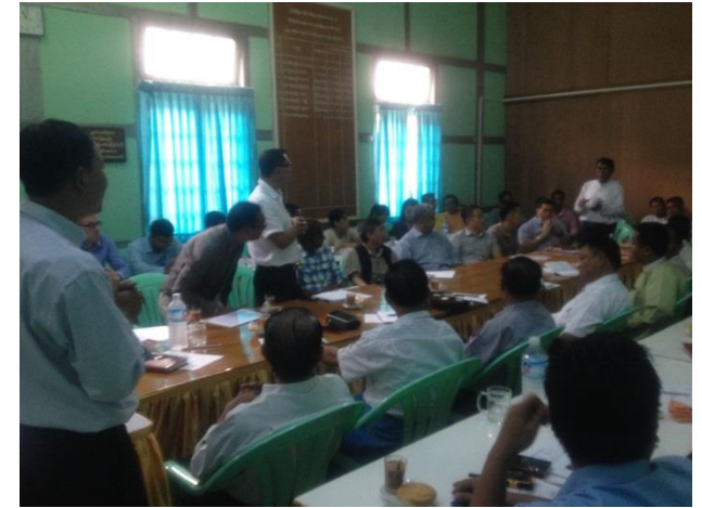
Photo 57: Public meeting in Myingyan GAD (Township)