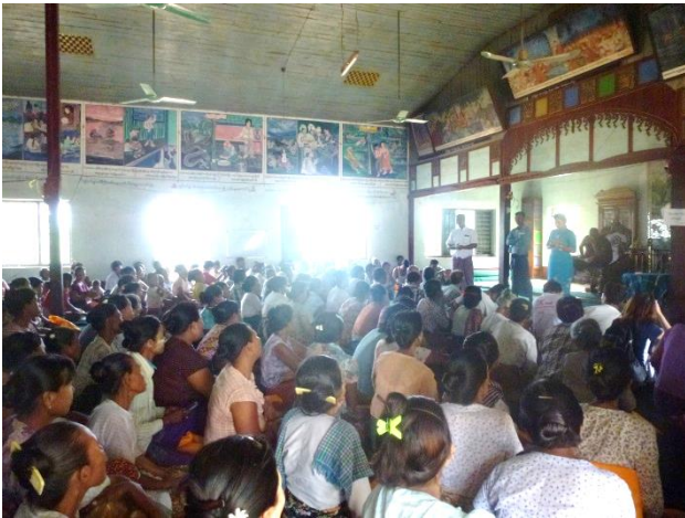
Photo 76: Public Meeting in Gyoke Pin (village)