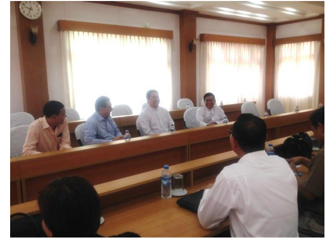
Photo 3: Face-to-face meeting with Ministry of Electricity and Industry, Mandalay Region