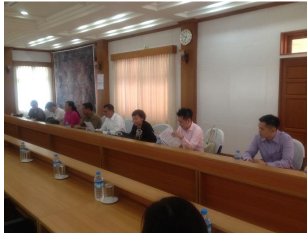
Photo 5: Face-to-face meeting with Ministry of Electricity and Industry, Mandalay Region