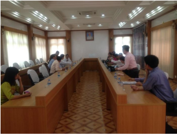
Photo 1: Face-to-face meeting with Ministry of Electricity and Industry, Mandalay Region