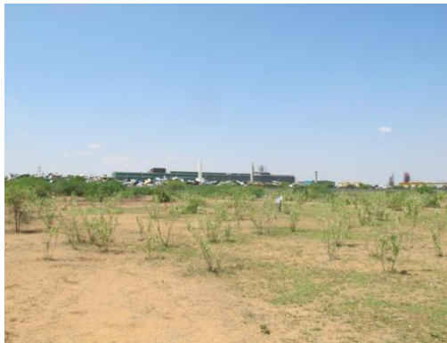
Site Looking Towards Steel Mill