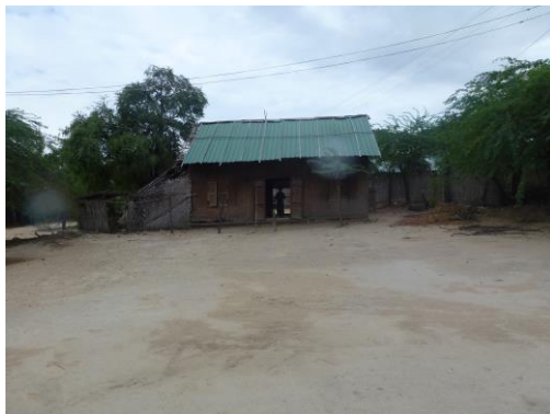
Sa Khar Village

Typical elements of this LCU are shown within the below photos.