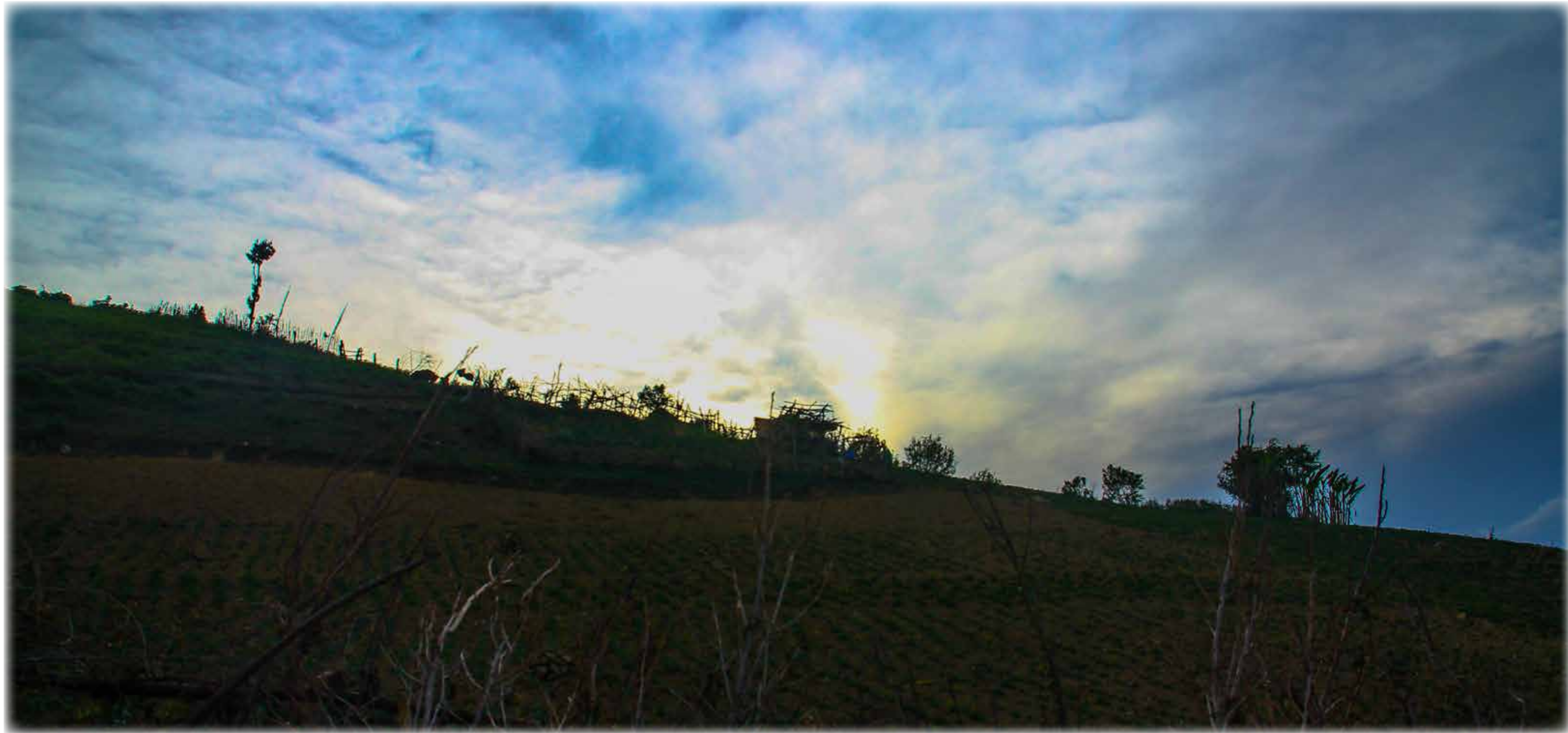
Ap Naku's land in Rangshikhar at sunset.