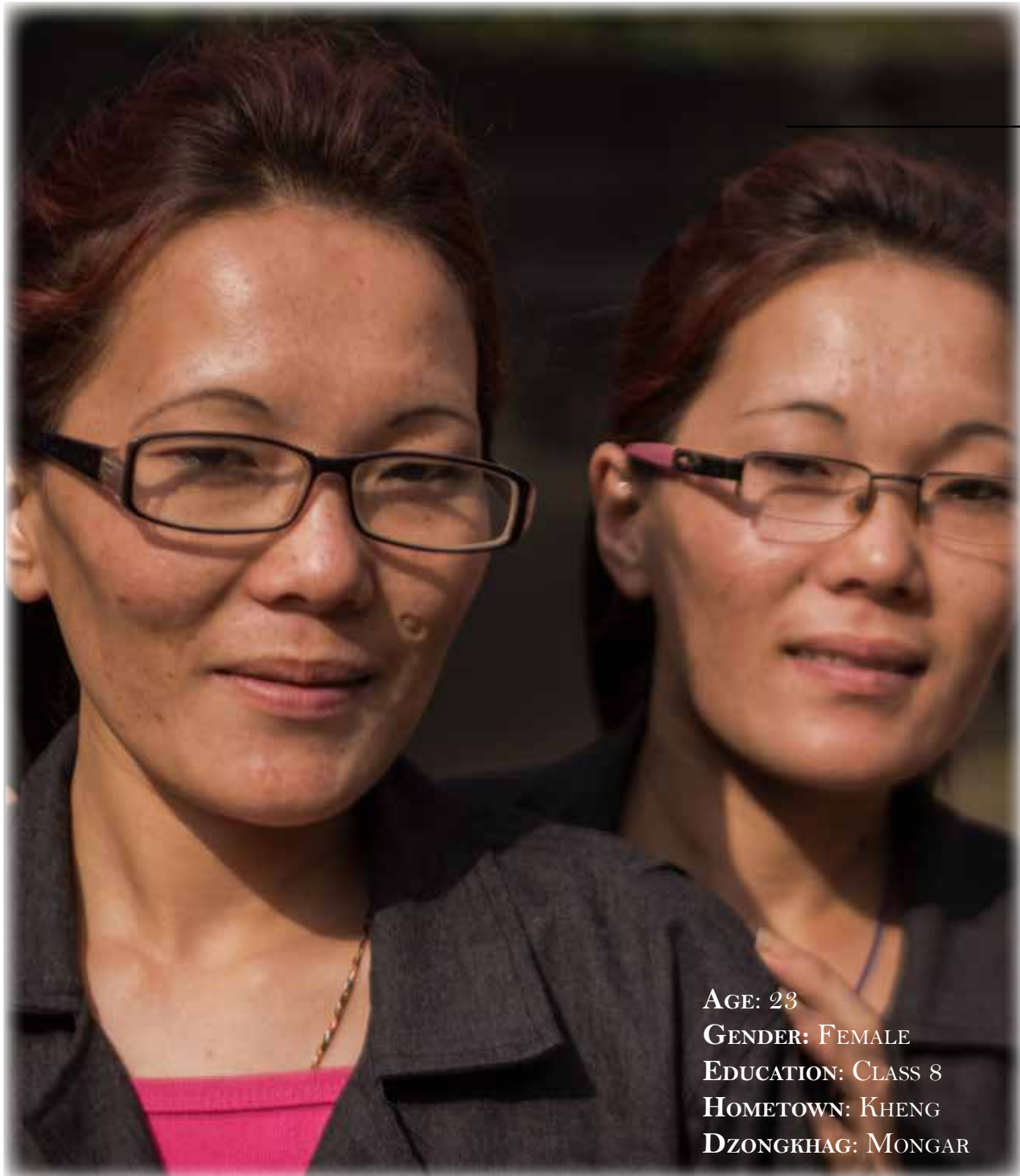
AGE: 23 GENDER: FEMALE EDUCATION: CLASS 8 HOMETOWN: KHENG DZONGKHAG: MONGAR