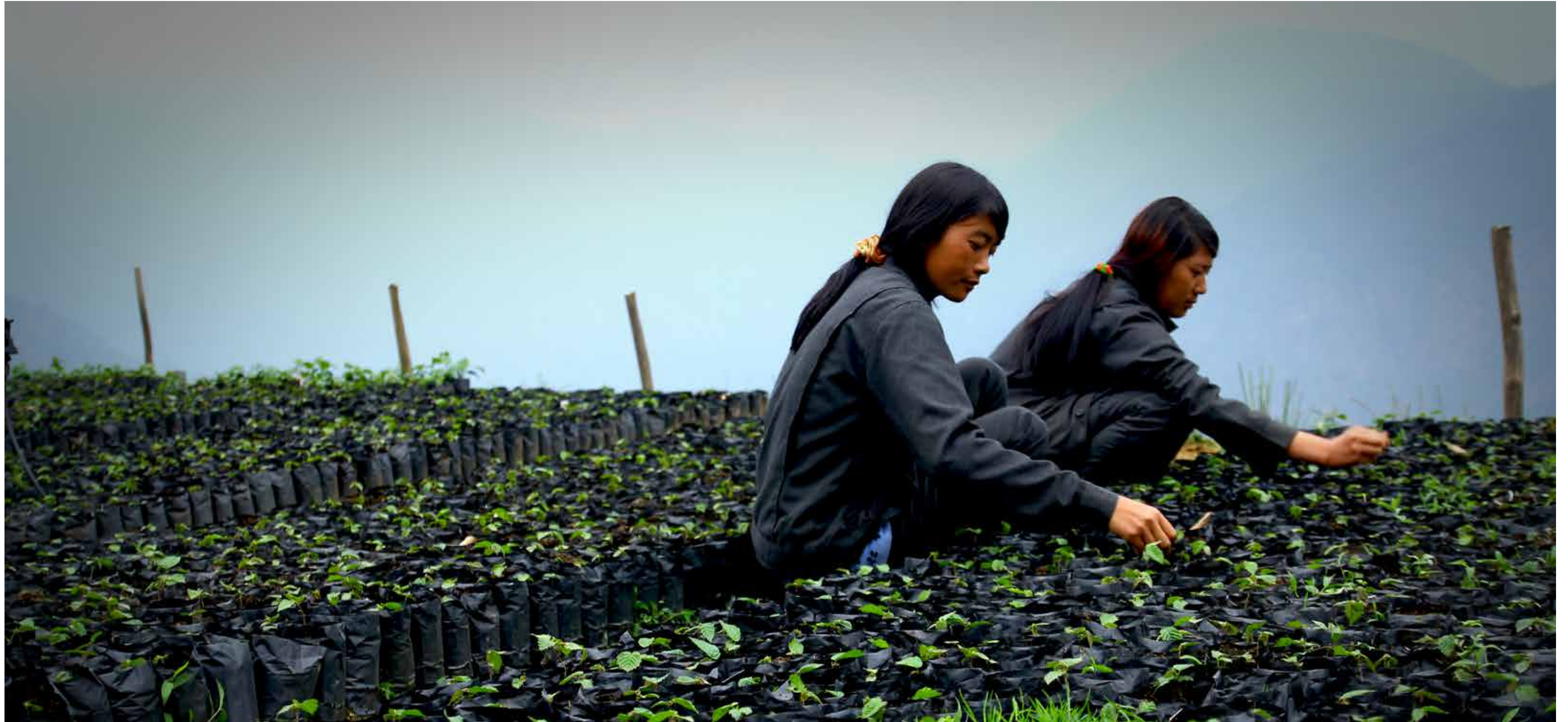
Staff monitor plants for any sign of pest or root damage in MH's Ngatshang Nursery.