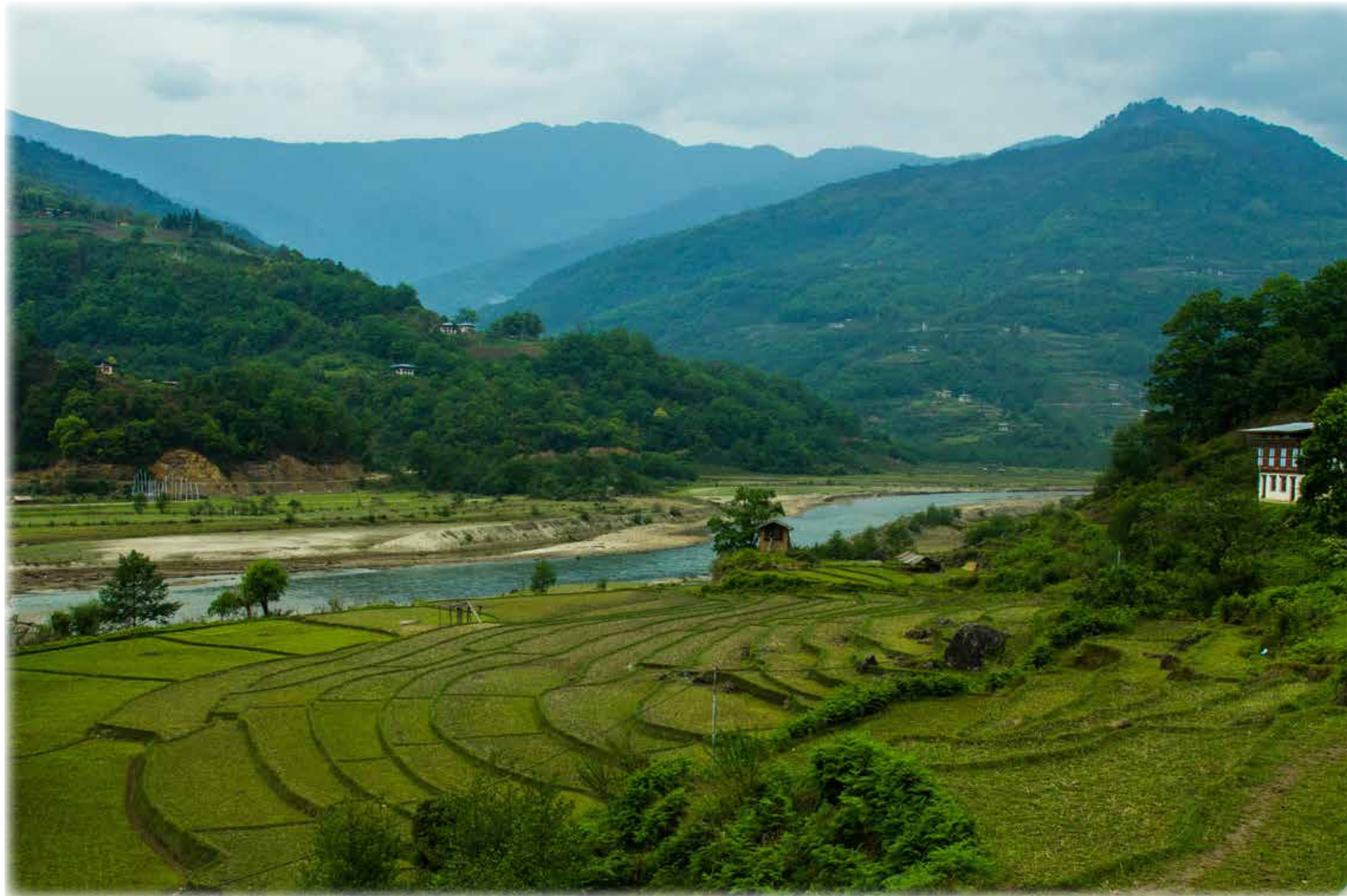
Gurula's plot in Bumdeling.

He started as a farm laborer, cultivating and harvesting rice and barley in the terraced fields of Thimphu. Daily wages were less than palatable - just Nu 10 ($0.20), which at that time, was just enough to buy two meals a day. He then found a job chopping wood for the army camp in Thimphu, where he received Nu 70/day.