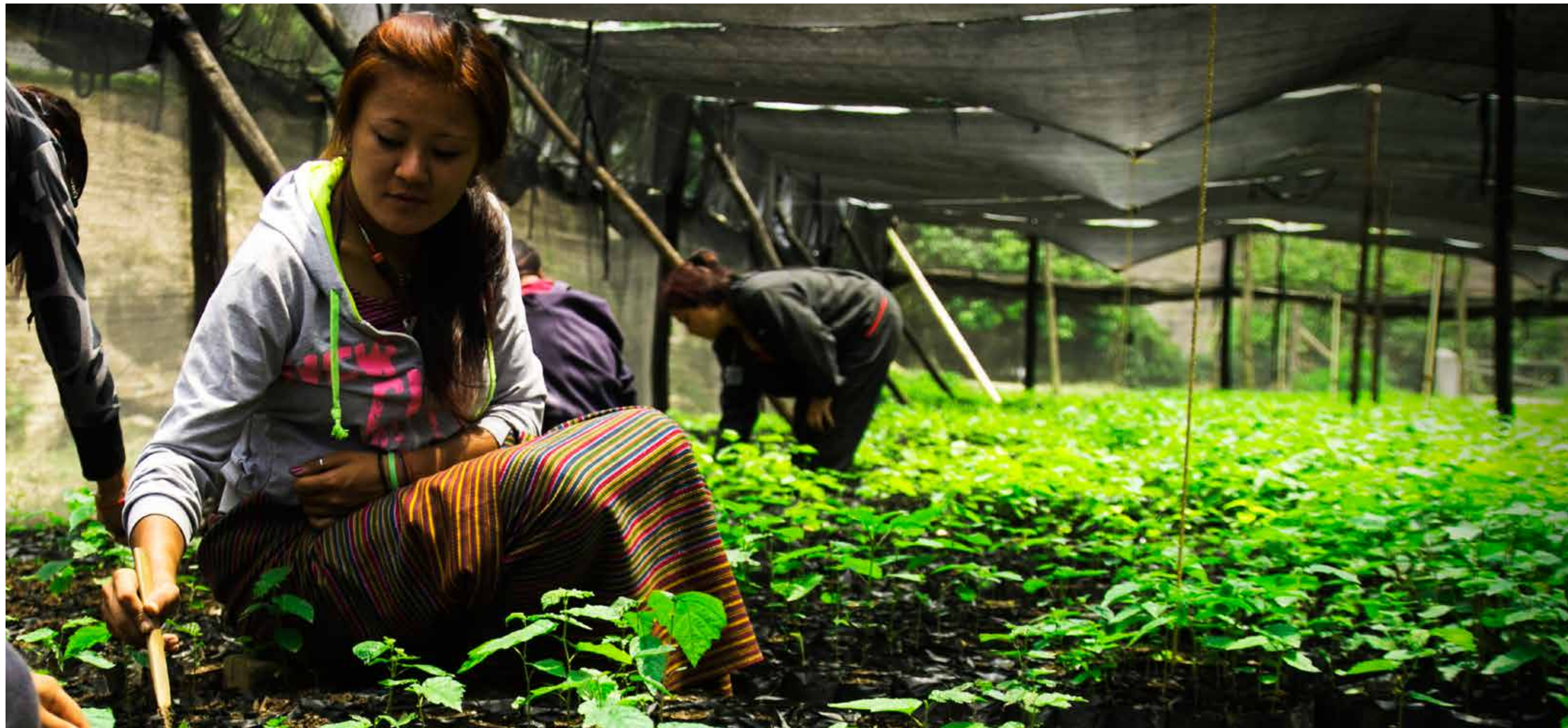
Nursery staff manage and care for the plants in MH's Lingmethang Nursery.