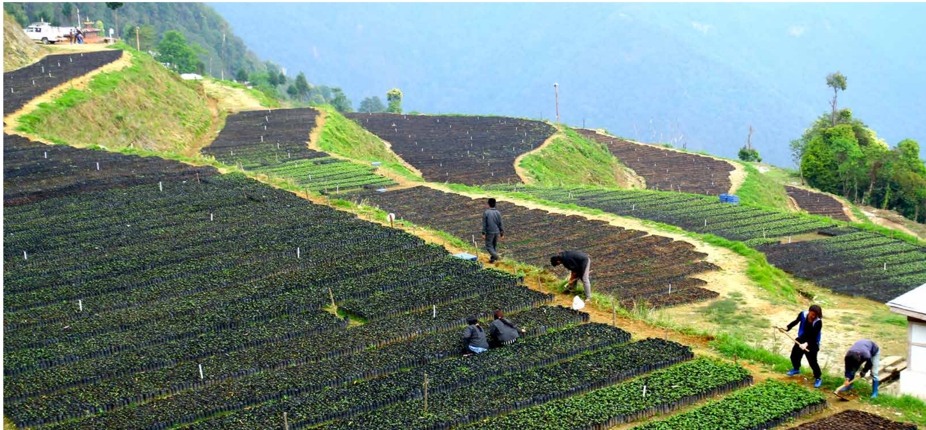
MH's other nursery is based in Ngatshang, Mongar, where plantlets are further weaned and prepared for distribution to farmers.