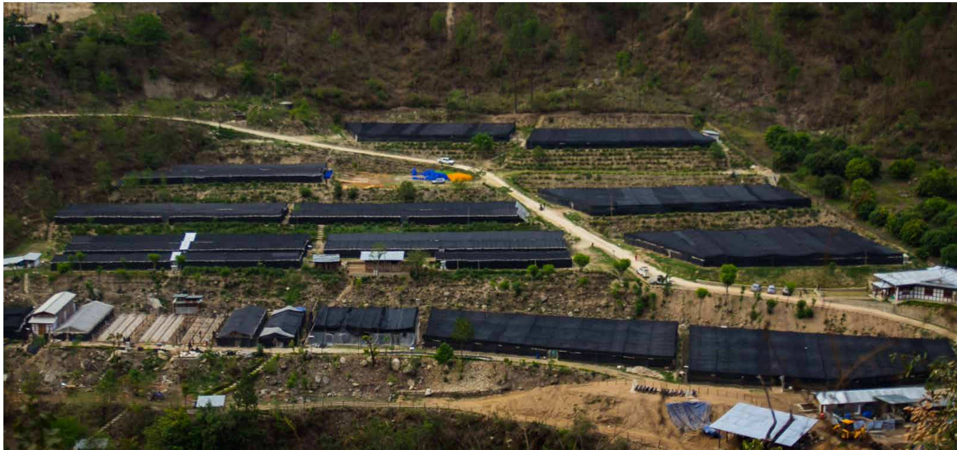
Mountain Hazelnut Nursery in Lingmethang, Mongar, where tissue culture plantlets are weaned and hardened.