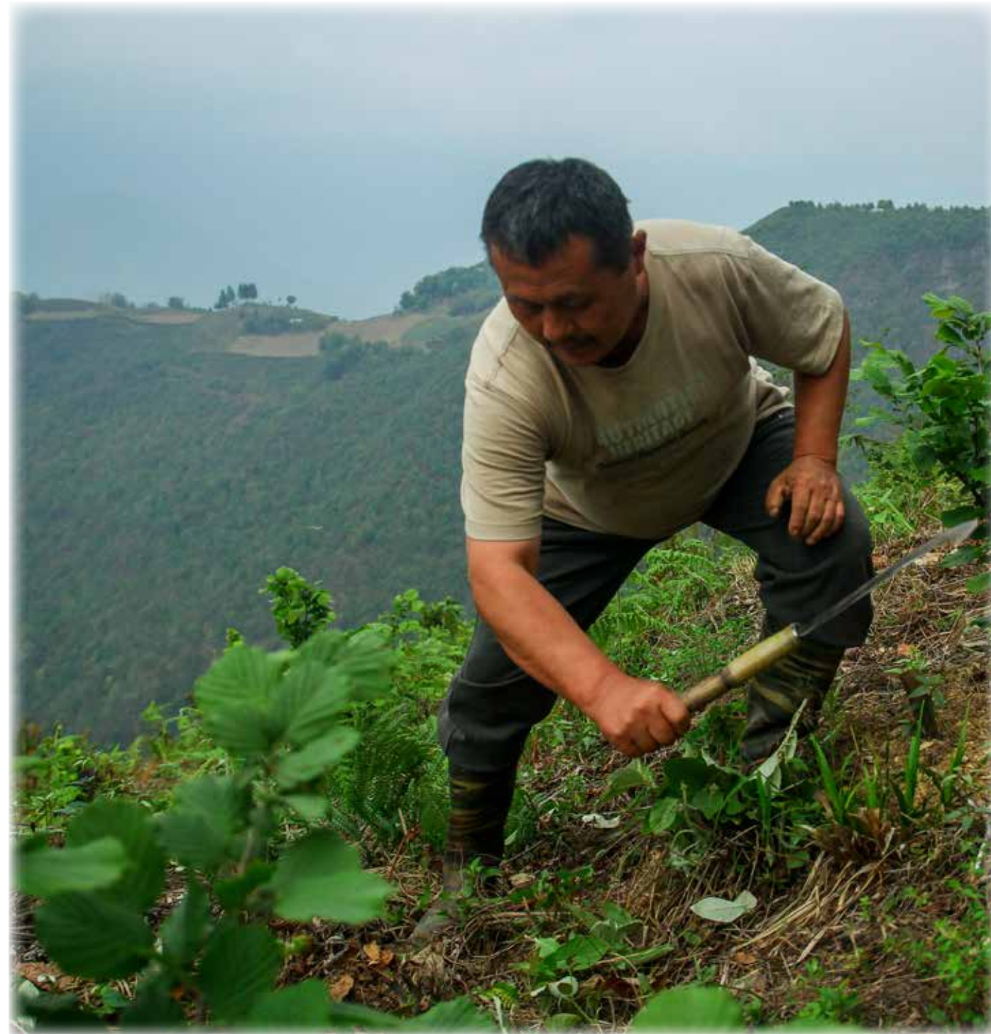
Sangay regularly clears scrub vegetation to keep the land clear and suitable for commercial crops like hazelnuts.

“All I do is for my children’s education. School is expensive, and we farmers cannot afford to send them without some source of income. I hope that these trees can be part of that source.”