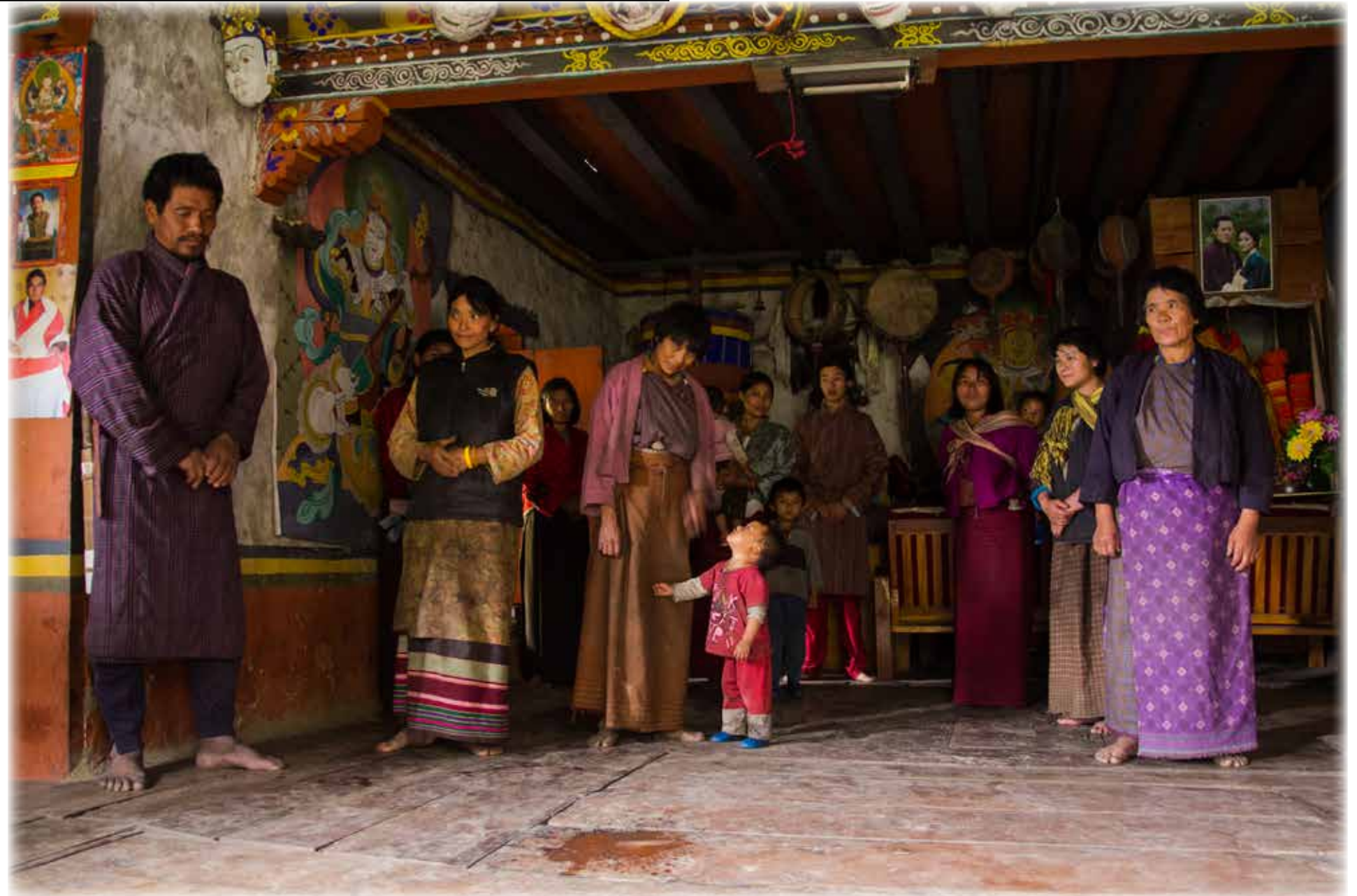
Villagers of Mangling gather to make offerings to guests.

"My father brought these practices to our village so that we can preserve our culture. Through this, we contribute to Our Kings' aspirations of Gross National Happiness."