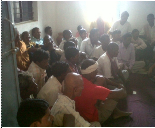
Photo 8: meeting with local villagers, Panchayat Office, Village Guma