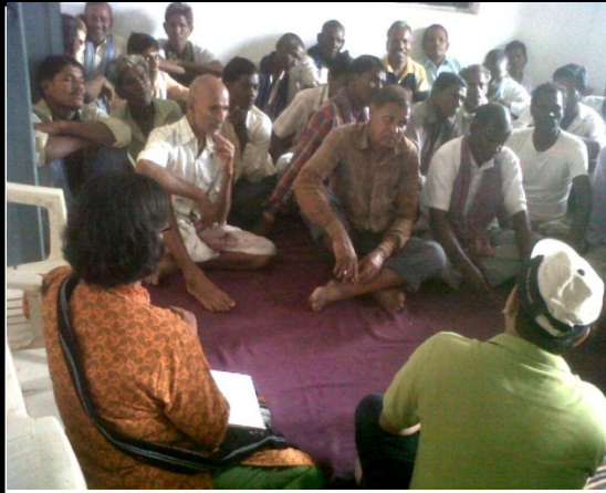
Photo 7: group discussion with the community Representatives, Guma, Panchayat Office