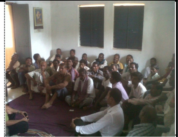
Photo 9: meeting with local villagers, Panchayat Office, Village Guma