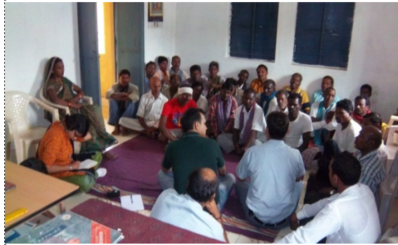
Photo 5: group discussion with the community Representatives, Guma, Panchayat Office