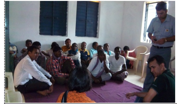
Photo 6: group discussion with the community Representatives, Guma, Panchayat Office

ERM India Private Limited Building 10, 4 th Floor, Tower A, DLF Cyber City Gurgaon - 122 002, India Board: +91- 0124 4170300 Fax: 0124- 4170301