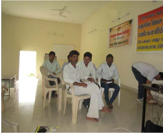
Photo 104 meeting with local villagers, UTCL Community Centre