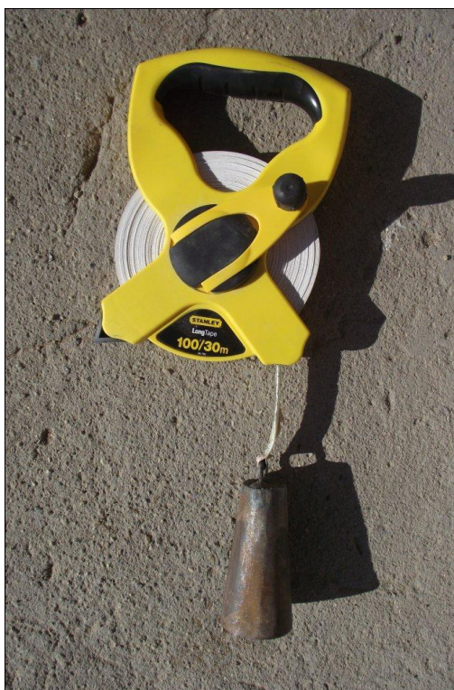
Photo 1: Khlopushka used by herders to detect groundwater level in their well.

During these initial herder meetings, Oyu Tolgoi provided equipment and Oyu Tolgoi water team's water monitoring method, to each herder (see Annex B ); and instructed the herder on how to measure their well levels with the "khlopushka", how to keep their daily records, and how to crosscheck their collected data with previous data, as well as with data gathered by the Oyu Tolgoi water team. As appropriate if the herder is available when Oyu Tolgoi undertake their monitoring, joint monitoring is undertaken to strengthen data QA/QC.