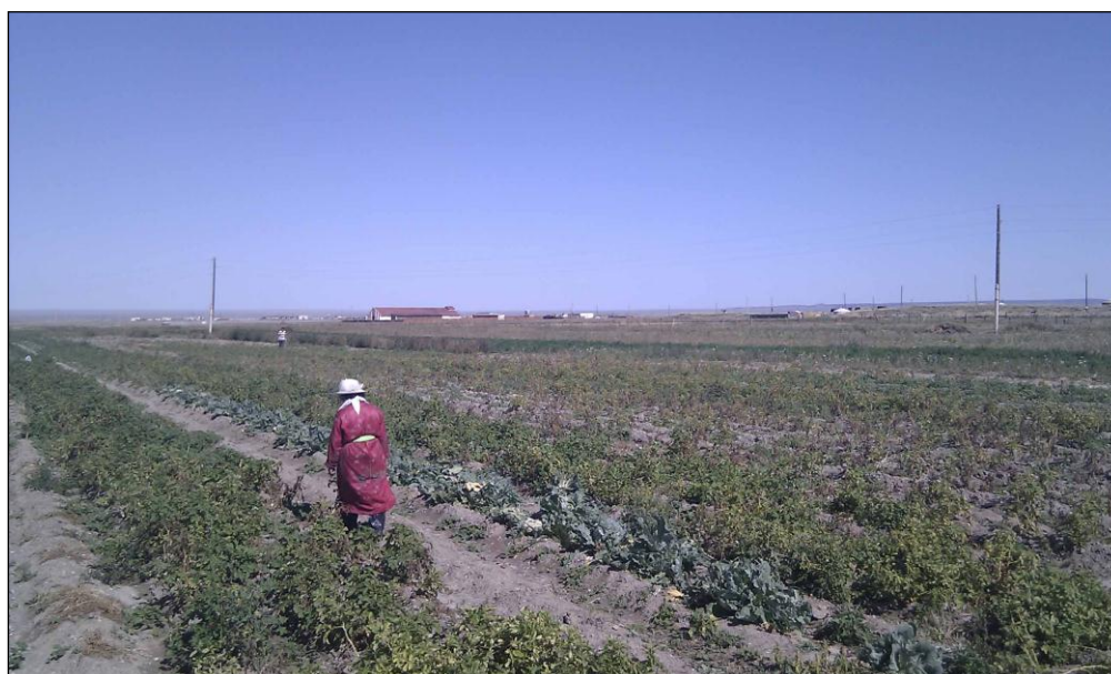
Figure 9.2: Agricultural Cooperative in Dalanzadgad that Supplies Vegetables to Oyu Tolgoi

Crop production has a significantly lower contribution to local income than livestock, but local production of potatoes and vegetables is important for the subsistence of families. Oyu Tolgoi has recently contributed to increasing the crop production sector in the aimag and associated employment by facilitating the expansion of an agricultural cooperative in Dalanzadgad to supply vegetables to the Project (see Figure 9.2 ). Production of animal fodder is also important, but there is reportedly a lack of suitable land which constrains these activities. Between 2003 and 2007, the average quantity of hay prepared (by soum ) was 316 tonnes, i.e., 0.4-0.9 tonnes per livestock keeping household.