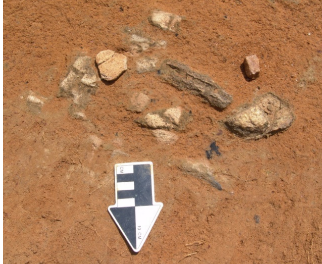
Head of pit in zone 2 showing some breaks of stones and wood coal