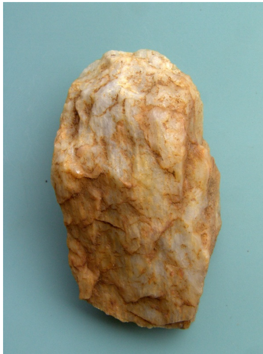
Axe from lattice quartz