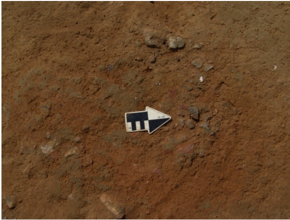
Circular trace showing a probable pit

It is made up of six pits that are recognizable by way of circular black spots, stone heaps mixed with pottery and charcoal near huts and graves. The site is surrounded by a highly anthropogenic vegetation.