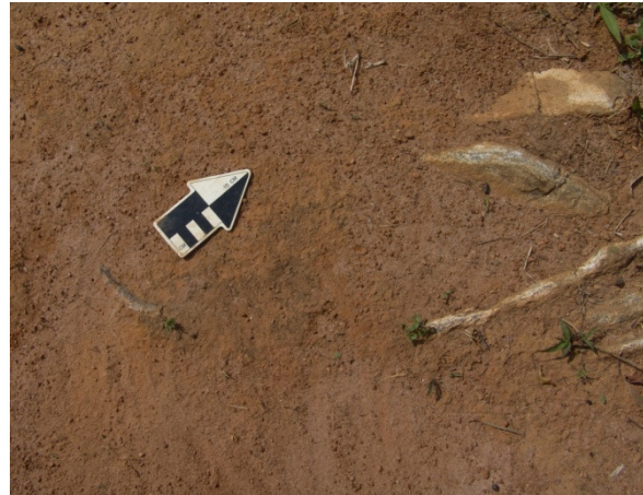
Stones associated with a pottery