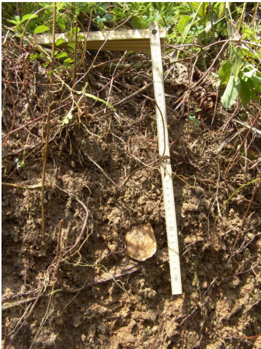
Place where the stone axe was found

This zone is represented by a stone tool carved out of a greasy quartz found encrusted on a slope of about one metre high, close to the Gongoyima stream. This kind of carved tool is rare and it is quite exceptional to find it in tact. The forest environment of the site is similar to the preceding one.