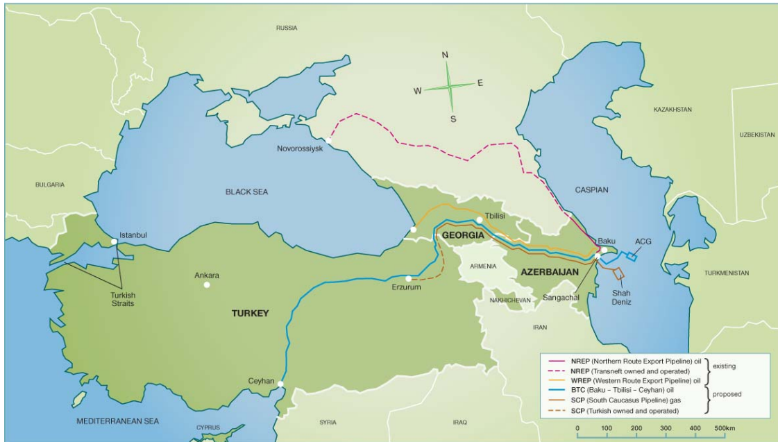
Figure 4.2: Existing and proposed export pipeline infrastructure from Azerbaijan

The 1760km pipeline will be buried along its entire length (Figure 4.2). The principal features of the pipeline and associated infrastructure are summarised below, and the key pipeline statistics are given in Box 4.4: