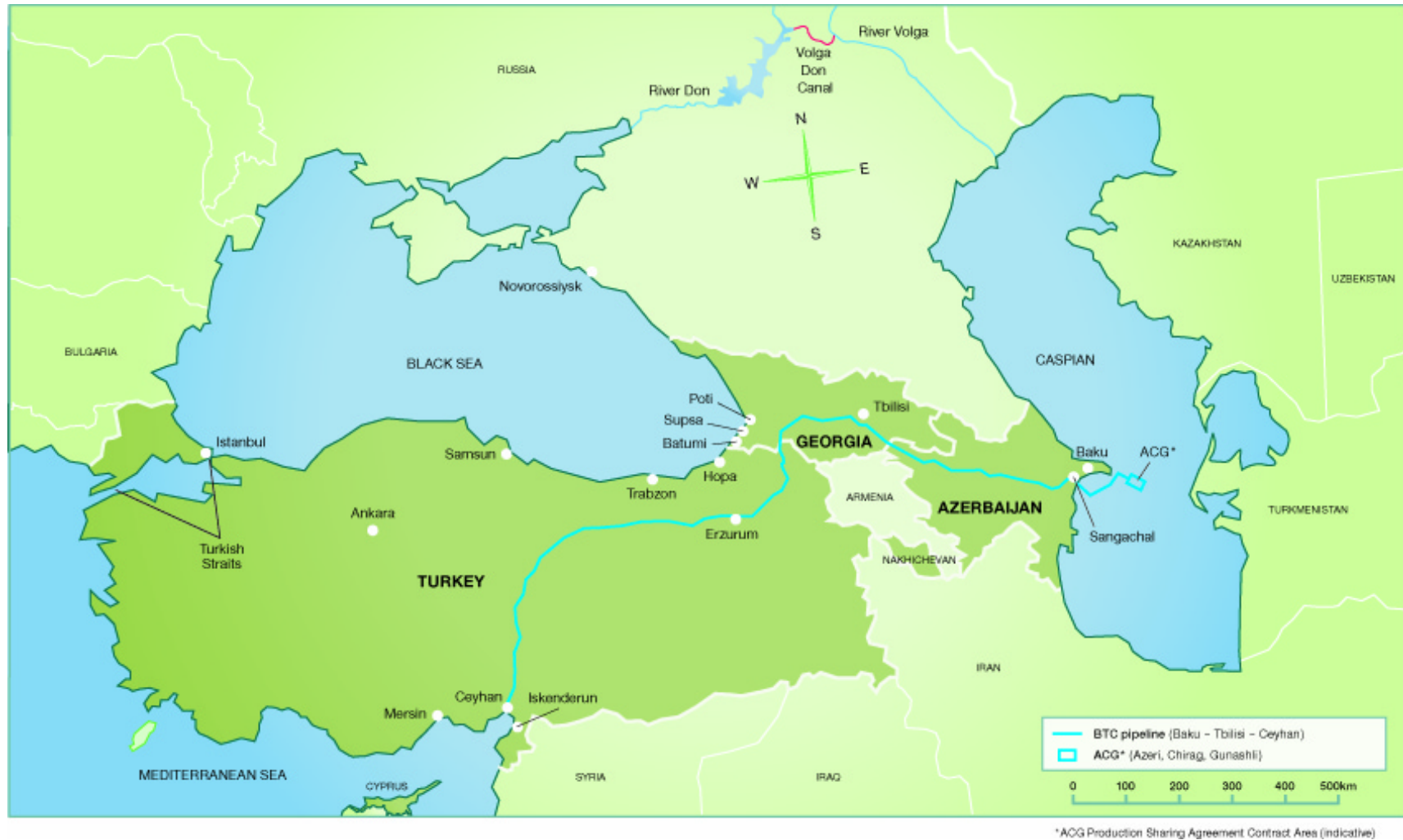
Figure 2 BTC Pipeline Route